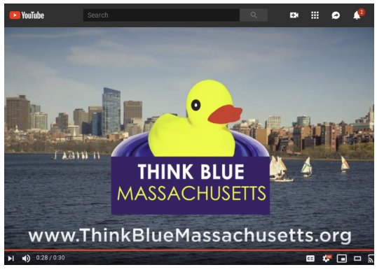
View the ad at <u>http://bit.ly/tbm-fowl-water</u>

On behalf of the members of the Merrimack Valley Stormwater Collaborative, Think Blue Massachusetts ran an educational advertising campaign from May 31st to June 17th, 2022. The "Fowl Water" (In both English and Spanish) video helps viewers visualize stormwater pollution in their community: