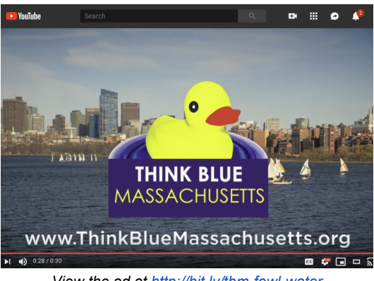
View the ad at <u>http://bit.lv/tbm-fowl-water</u>

On behalf of the members of the Fore River Stormwater Partnership, Think Blue Massachusetts ran an educational advertising campaign from May 31st to June 17th, 2022. The "Fowl Water" (In both English and Spanish) video helps viewers visualize stormwater pollution in their community: