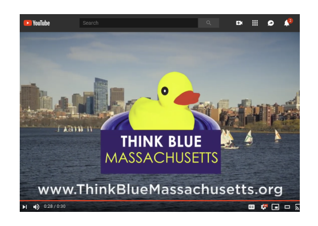
View the ad at <u>http://bit.ly/tbm-fowl-water</u>

This effort helps coalition members meet their requirements to "document in each annual report the messages for each audience; the method of distribution; the measures/methods used to assess the effectiveness of the messages, and the method/measures used to assess the overall effectiveness of the education program."