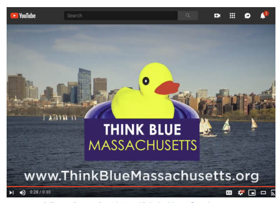
View the ad at <a href="http://bit.ly/tbm-fowl-water">http://bit.ly/tbm-fowl-water</a>

On behalf of the members of the Minuteman Advisory Group on Interlocal Coordination, Think Blue Massachusetts ran an educational advertising campaign from May 31st to June 17th, 2022. The "Fowl Water" (In both English and Spanish) video helps viewers visualize stormwater pollution in their community: