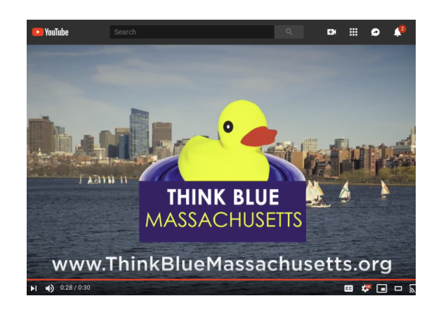
View the ad at <u>http://bit.ly/tbm-fowl-water</u>

This effort helps coalition members meet their requirements to "document in each annual report the messages for each audience; the method of distribution; the measures/methods used to assess the effectiveness of the messages, and the method/measures used to assess the overall effectiveness of the education program."