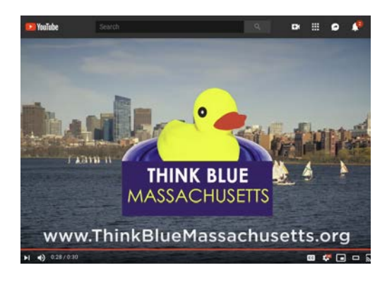
View the ad at <a href="http://bit.ly/tbm-fowl-water">http://bit.ly/tbm-fowl-water</a>

This effort helps coalition members meet their requirements to "document in each annual report the messages for each audience; the method of distribution; the measures/methods used to assess the effectiveness of the messages, and the method/measures used to assess the overall effectiveness of the education program."